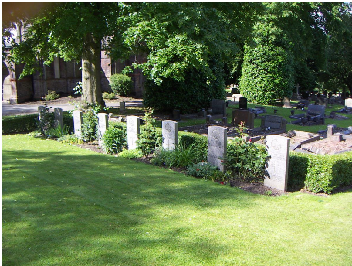
8 Australian War Graves in Hartshill Cemetery, Stoke-on-Trent

Hartshill Cemetery, Stoke-on-Trent contains 151 Commonwealth War Graves Commission War Graves – 91 from World War 1 & 60 from World War 2. There are 8 Australian WW1 Graves in this Cemetery.