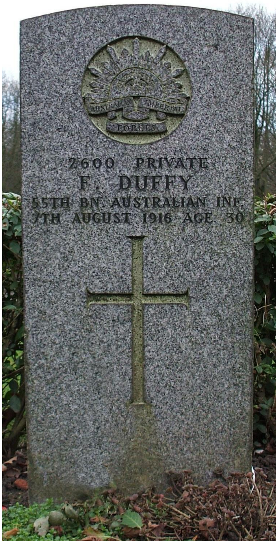
Photo of Private F. Duffy's Commonwealth War Graves Commission Headstone in Hartshill Cemetery, Stoke-on-Trent, Staffordshire, England.