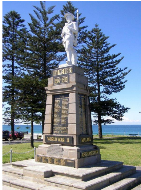
Stockton War Memorial